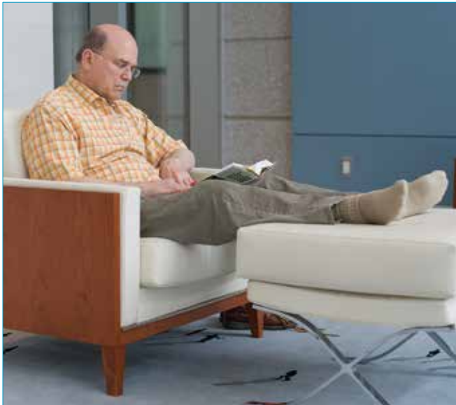
Put your feet up when you are sitting.